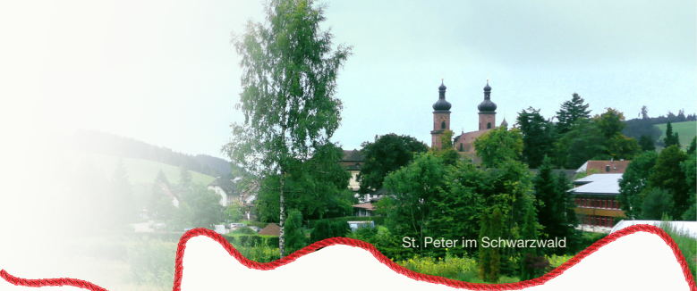
St. Peter im Schwarzwald